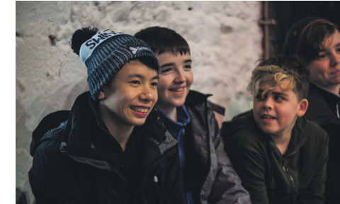
Students having fun at Bunratty Castle

workshop with the World Famous Bunratty Castle Entertainers